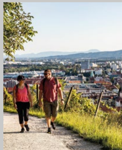
FROM THE CENTER UP TO PIRAMIDA HILL