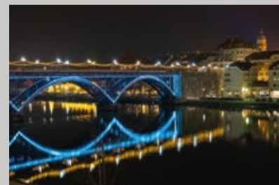
OLD BRIDGE ON DRAVA RIVER