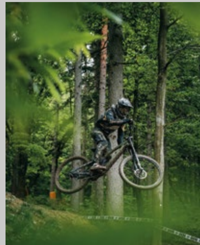
DOWNHILL MTB WORLD CHAMPIONSHIP