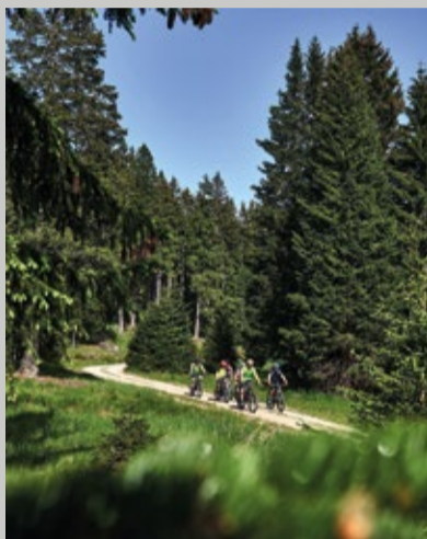
EXPLORE MARIBORSKO POHORJE BY BIKE