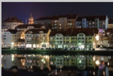
OLD CITY CENTER BY DRAVA RIVER