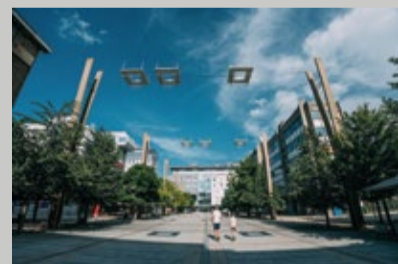
TRG LEONA ŠTUKLJA (Leon Štukelj Square)