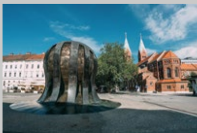
TRG SVOBODE (Liberty Square)